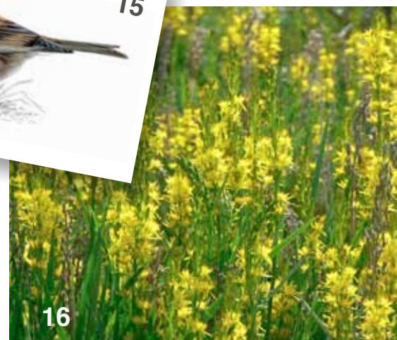
Photo credits : Images 1,2, 6, 9, 10, 11 and 16 Tim Melling. Images 3,13,5 12, 15 Mike Langman (rspb-images.com). Image 14 Robert Melling, age 15. Images 4 and 8 Andy Hay (rspb-images.com). Image 7 Ben Hall (rspb-images.com).